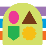
Badges & Awards

Troops must log an activity into the Troop Pathway Survey before October 1, 2025 to qualify for the Adventure or Friendship Pathways.