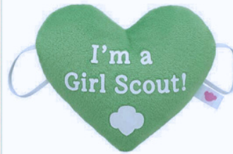
GS Brownie Wristie