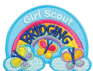
Bridging Iron-On Patch $1.75

You may also want to add a Fun patch or a Journey book to add to the celebration!