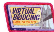
Virtual Bridging Sew-On Patch $1.50